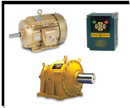
Motors, VFD's Reducers