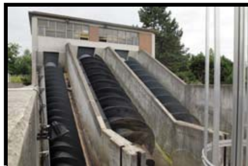
Gates Poly Chain Drives for: Screw Pumps Fans Agitators Scrapers

Adhesives, Sealants Coatings for: Bar Screens Grit Chambers Clarifiers Aeration Tanks