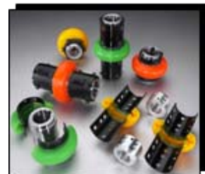
Couplings for Every Application