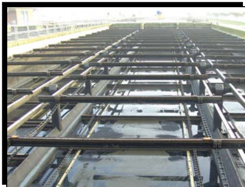
Wastewater Treatment Chain Clarifiers, Collectors, Water Screens