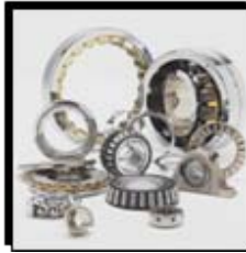
Cooper Split Bearings Ball & Roller Bearings