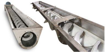
Screw Conveyor & Shaftless Conveyors